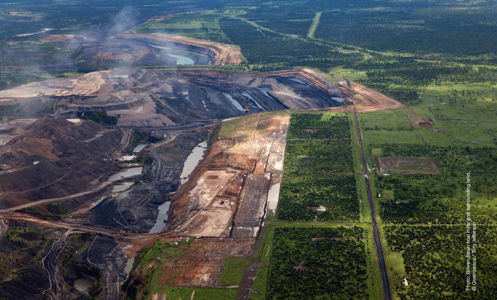
Photo: Bowen Basin coal mine and surrounding land. © Greenpeace / Tom Jefferson